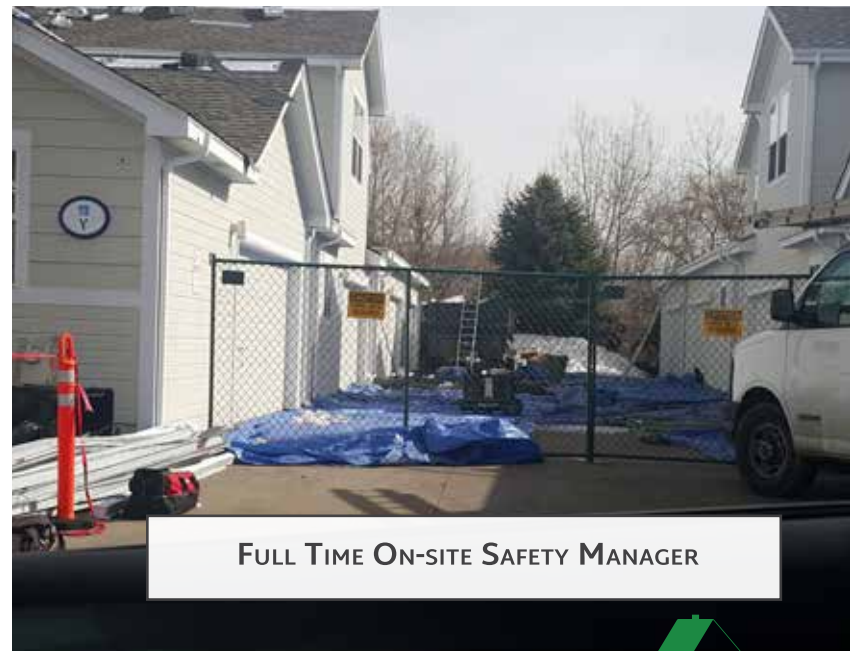
FULL TIME ON-SITE SAFETY MANAGER