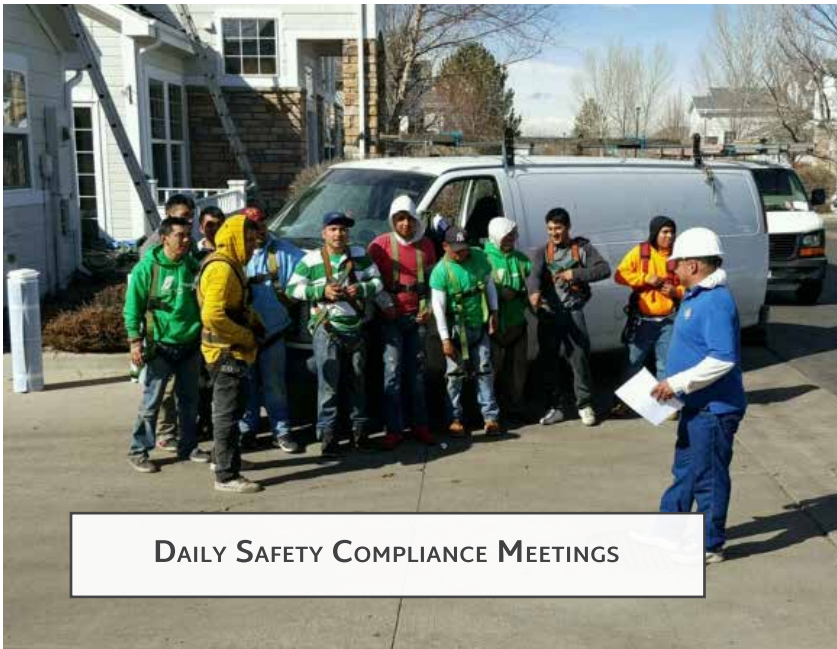
DAILY SAFETY COMPLIANCE MEETINGS