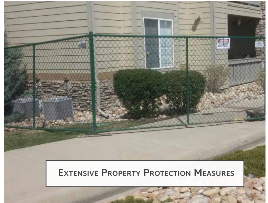
EXTENSIVE PROPERTY PROTECTION MEASURES