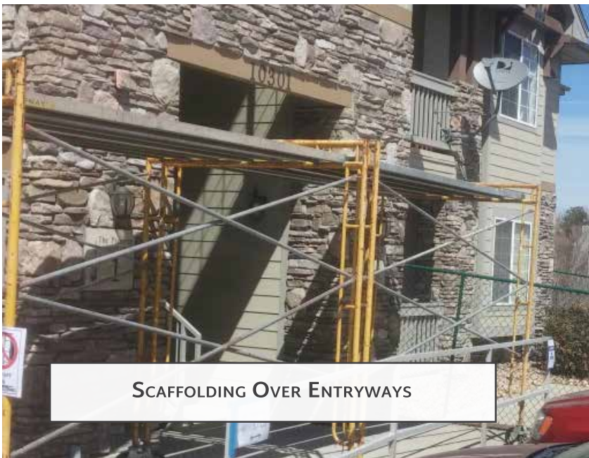
SCAFFOLDING OVER ENTRYWAYS